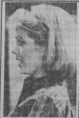
M. B. Birney to find out who set him up, at 10:30 on Channel 7.

SPARKS FLY when Elyse (Meredith Baxter Birney) and her mother argue over how a separated woman should behave as Elyse's mom goes out on a date on "Family Ties," at 9:00 on Channel 4. . . . Jemima comes closer to uncovering the secret behind a nun's mysterious death in the second part of "Quiet as a Nun," on "Mystery" at 8 on Channel 2. . . . and "Simon and Simon" are hired by the wife of an undercover cop accused of murder.