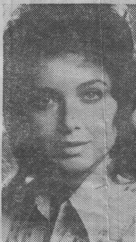
Suzanne Pleshette . . . back on CBS soon.

"We think she is a very attractive, very popular, very capable