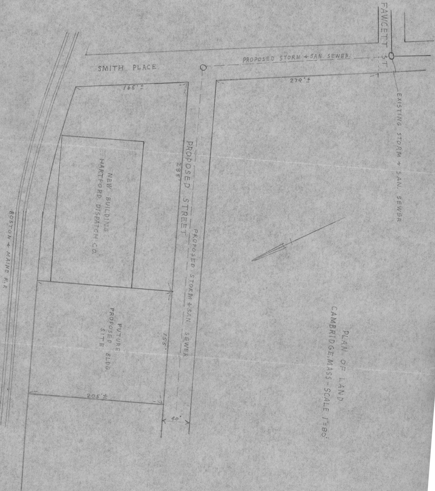
PLAN OF LAND CAMBRIDGE, MASS - SCALE 1"=80'