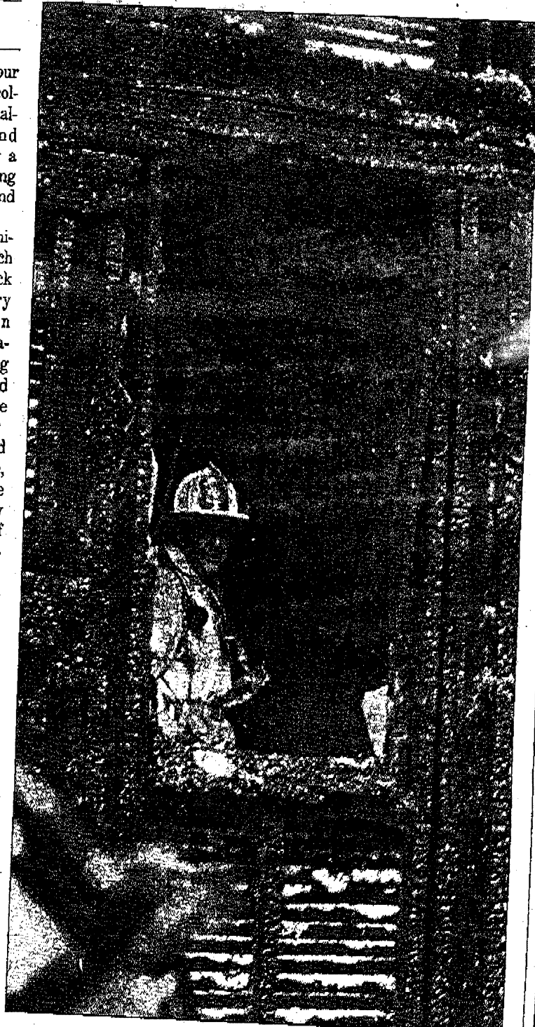
A firefighter looks out of a burned house in Somerville yesterday. Firefighters from several towns battled the Dane Street blaze.

Three other adjacent buildings sustained minor fire damage.