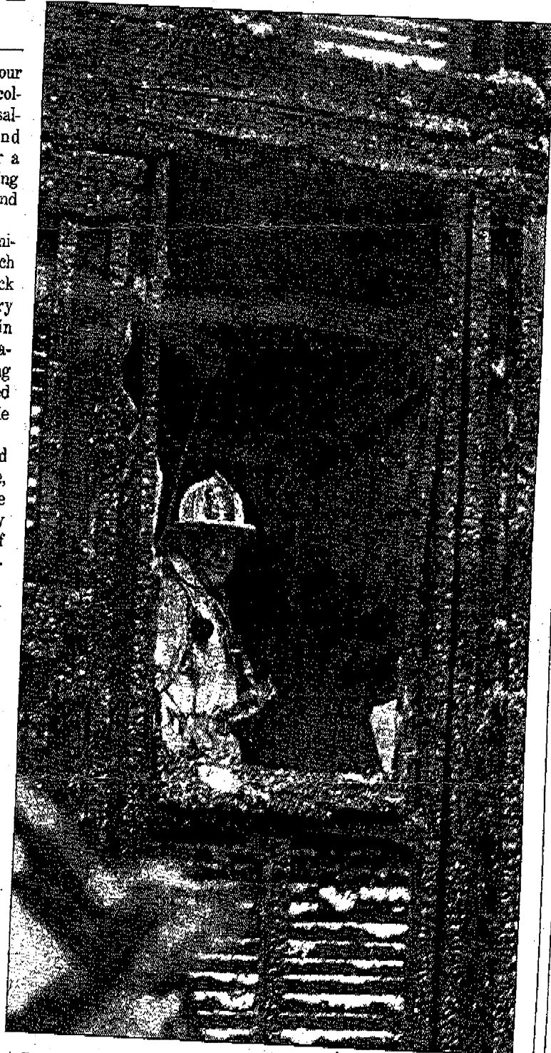
A firefighter looks out of a burned house in Somerville yesterday. Firefighters from several towns battled the Dane Street blaze.

Three other adjacent buildings sustained minor fire damage.