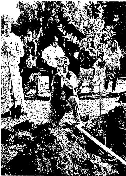
A community forester

Trees are not simply requested and dropped off. Interested customers begin by attending a neighborhood meeting where they learn about proper tree planting and care. A "community forester" then visits the property and identifies appropriate locations (western exposures are best) and recommends species for maximum energy savings. Residents select from 38 tree species, from large canopy trees like the red maple to