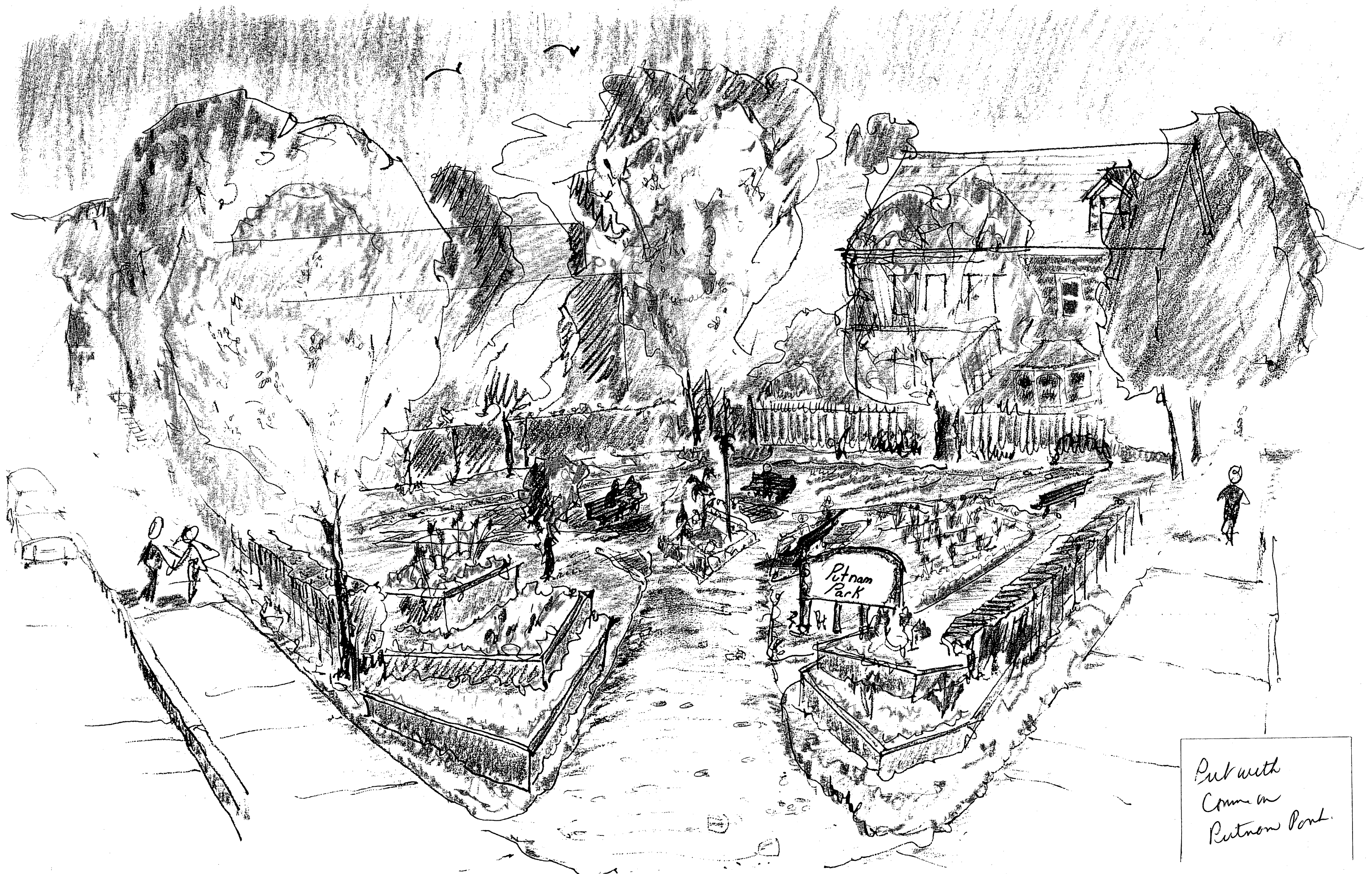
Put with Cove on Putnam Pond.