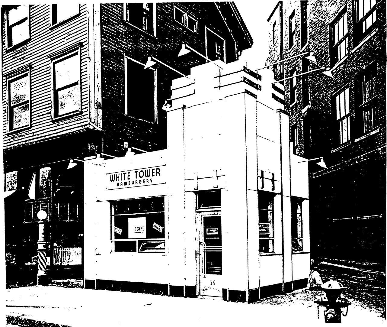
WHITE TOWER RESTAURANT, AS REFACED IN 1938 25 CENTRAL SQUARE