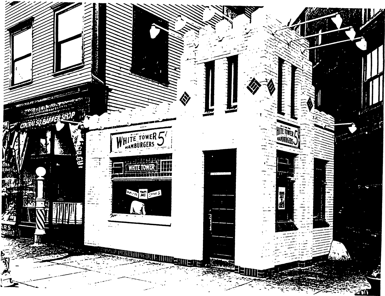
WHITE TOWER RESTAURANT, AS BUILT IN 1932 25 CENTRAL SQUARE