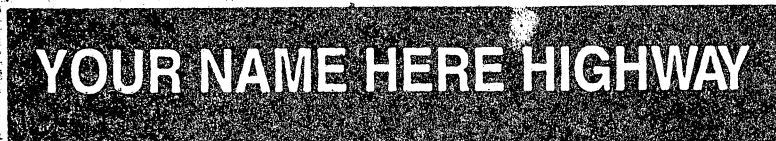
S201C STREET SIGN 6"x36" 22 letters or spaces $60.00