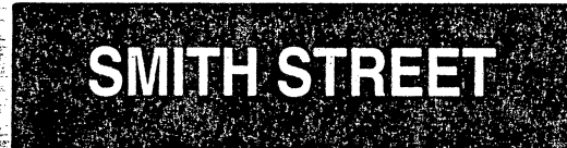
S201A STREET SIGN 6"x24" 13 letters or spaces $40.00

Replicas of street signs are highway green metal with white lettering. Available in 3 different sizes.