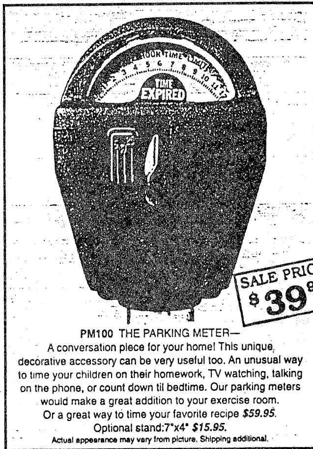
PM100 THE PARKING METER—

A conversation piece for your home! This unique decorative accessory can be very useful too. An unusual way to time your children on their homework, TV watching, talking on the phone, or count down til bedtime. Our parking meters would make a great addition to your exercise room. Or a great way to time your favorite recipe $59.95.