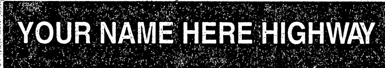
S201C STREET SIGN 6"x36" 22 letters or spaces $60.00