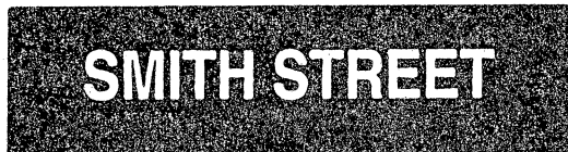
S201A STREET SIGN 6"x24" 13 letters or spaces $40.00

Replicas of street signs are highway green metal with white lettering. Available in 3 different sizes.